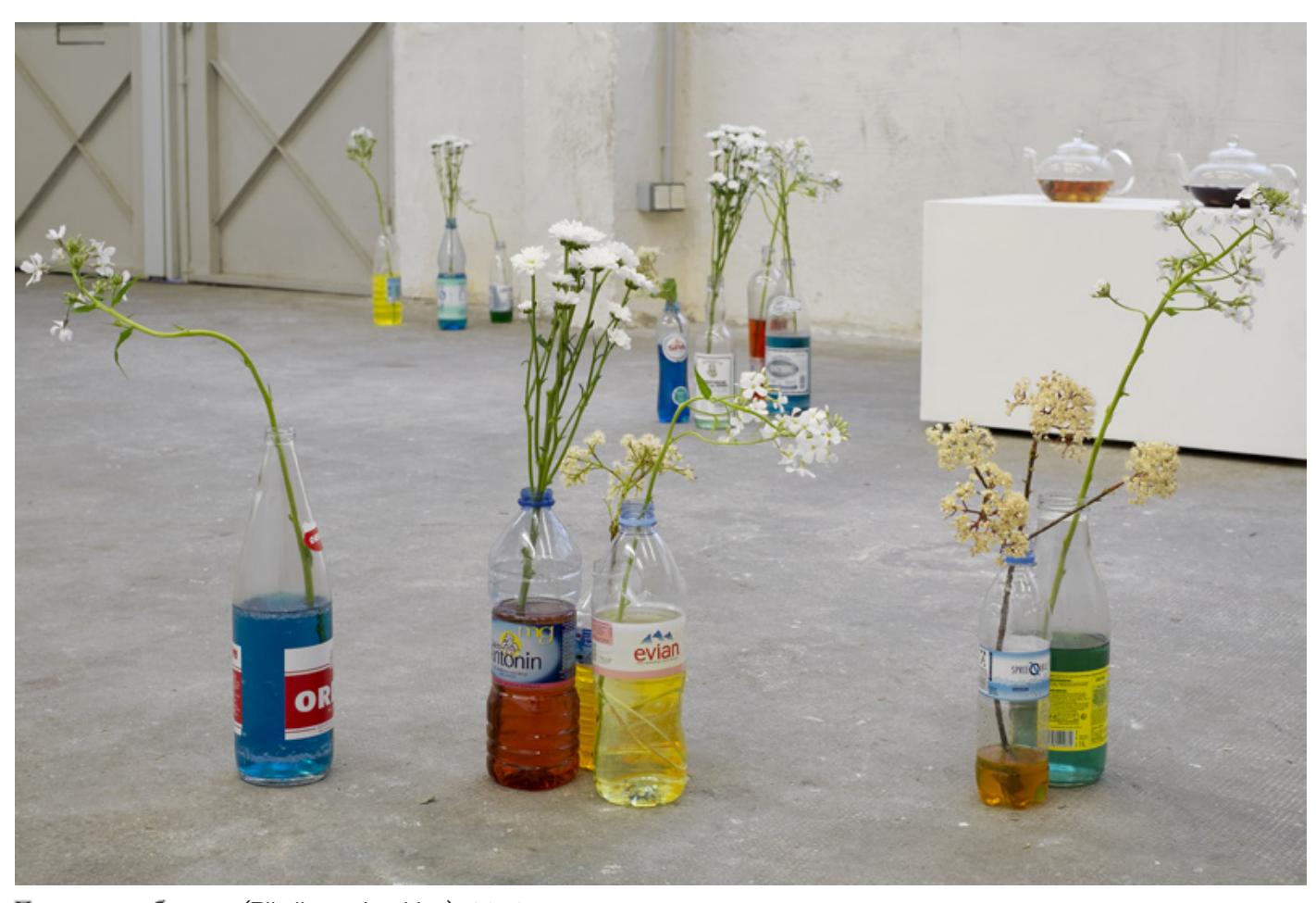
Пикник на обочине (Piknik na obochine), 2016 Mia Goyette, Eric Veit Exo Exo, Paris - Installation view