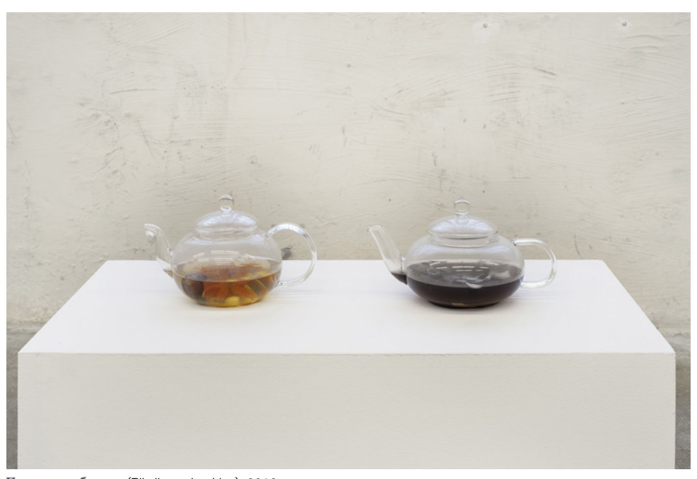
Пикник на обочине (Piknik na obochine), 2016 Eric Veit Exo Exo, Paris - Installation view