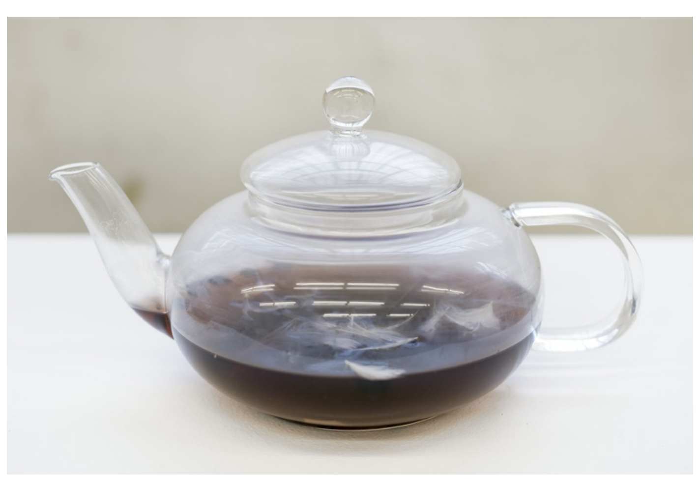
Eric Veit Coconut, cinnamon, corn, goose, 2016 Coconut, cinnamon, corn, goose 17 x 17 x 14 cm