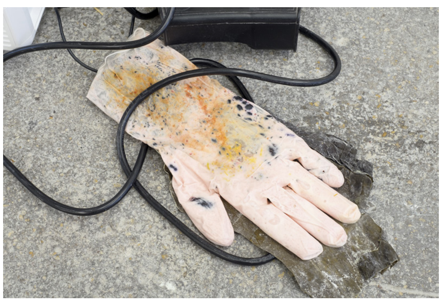
Martin Kohout Skinsmooth v.-2, 2016 Vinyl gloves, cable ties, algua and multiple edible materials Temporary form and various dimensions