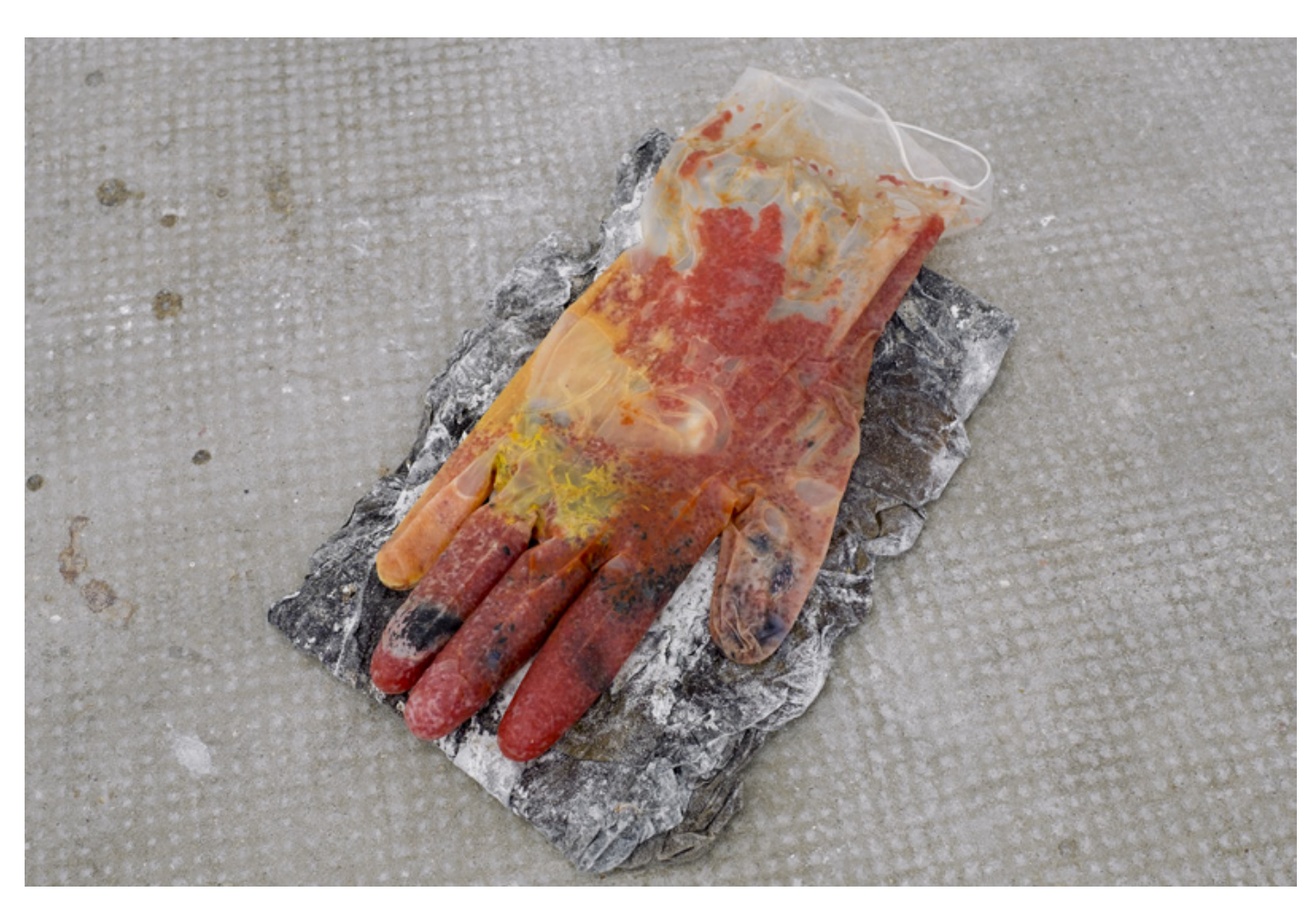
Martin Kohout Skinsmooth v.-2, 2016 Vinyl gloves, cable ties, algua and multiple edible materials Temporary form and various dimensions