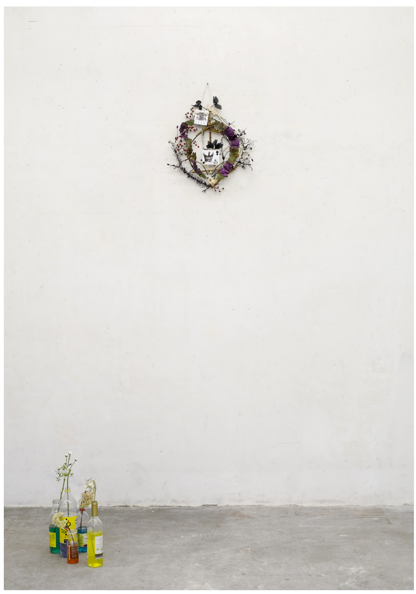
Пикник на обочине (Piknik na obochine), 2016 Jason Benson, Mia Goyette Exo Exo, Paris - Installation view