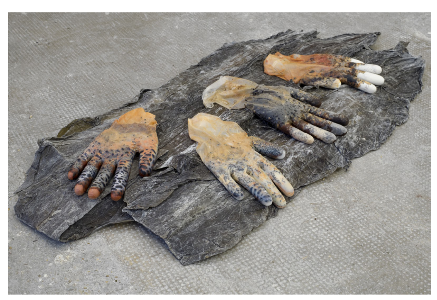
Martin Kohout Skinsmooth v.-2, 2016 Vinyl gloves, cable ties, algua and multiple edible materials Temporary form and various dimensions