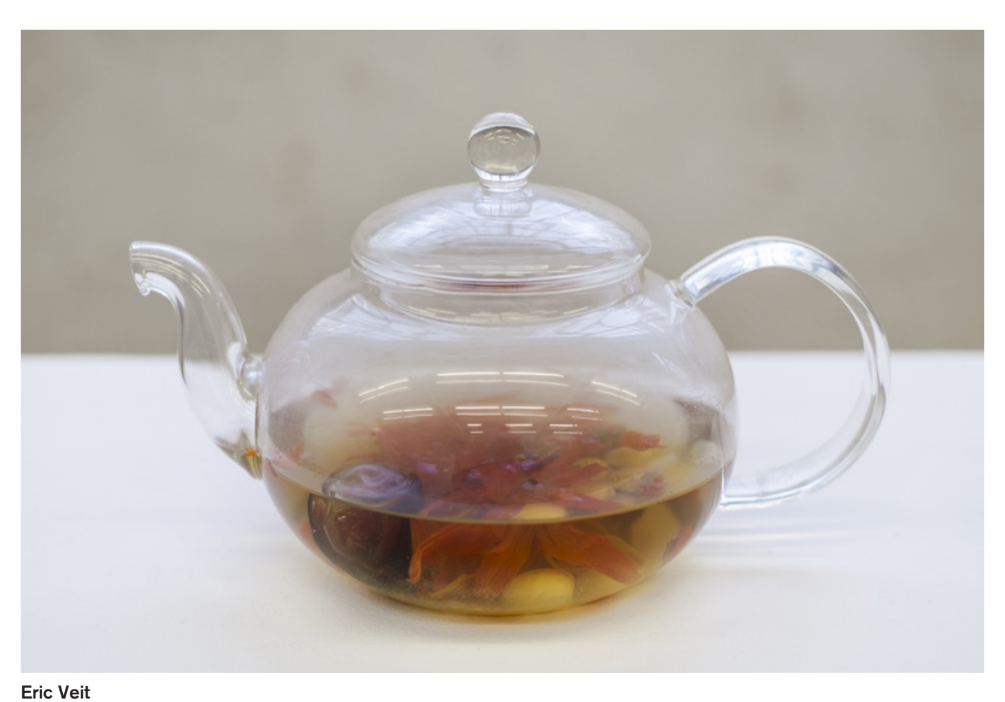
Lily, white lotus seed, ashwagandha, 20 cc of New York air, 2016 Lily, white lotus seed, ashwagandha, 20 cc of New York air 17 x 17 x 15 cm