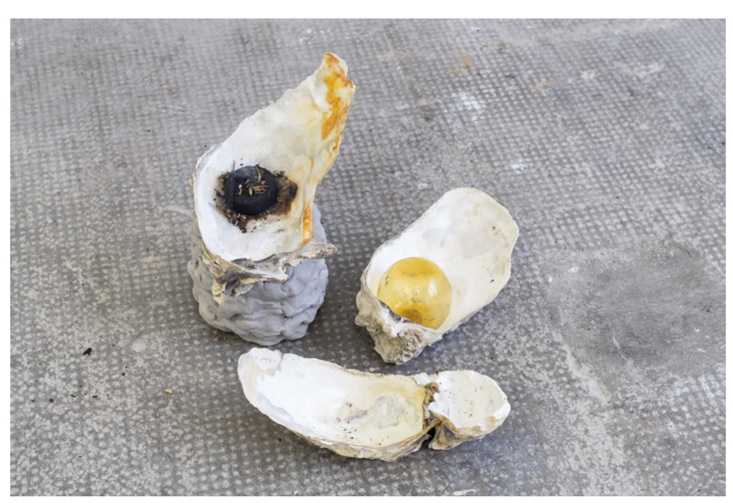
Hannah Lees Into eternity of which this vegetable world is but a shadow, 2013 Oyster shells, glass ball, air-drying clay, incense made with magical intent Variable dimensions