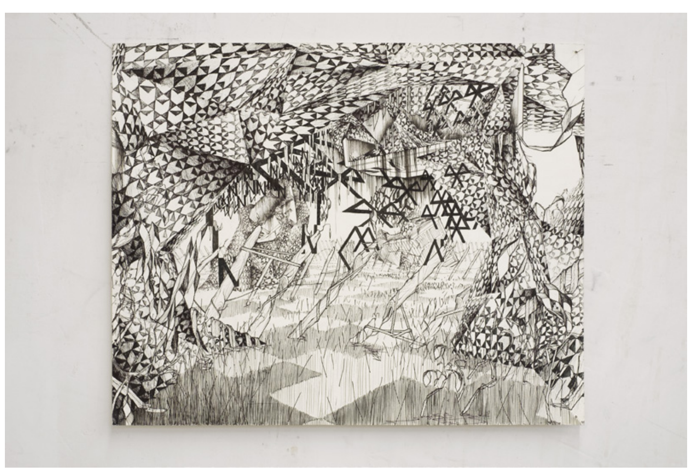
Viktor Timofeev Weaver of Dreams (MONSTROCITY), 2011 Ink on paper 35 x 40 cm