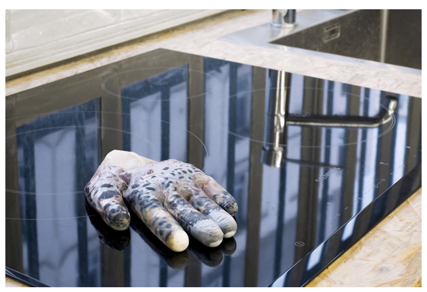
Martin Kohout Skinsmooth v.-2, 2016 Vinyl gloves, cable ties, algua and multiple edible materials Temporary form and various dimensions